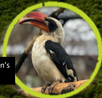
Von Der Decken's Hornbill