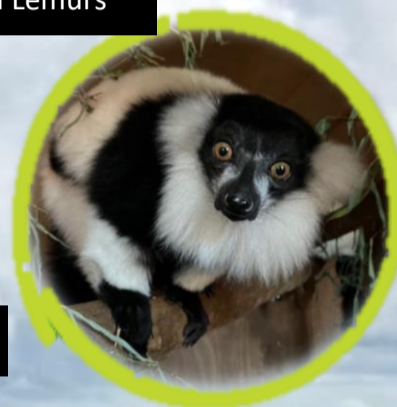
Black and White Ruffed Lemurs