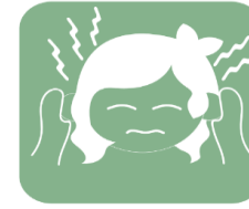
Noise in this area