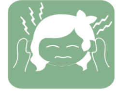
Noise in this area