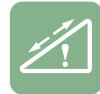
Slope/change in levels