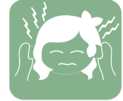
Noise in this area