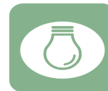
Low light levels