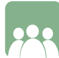
Busy area coming up