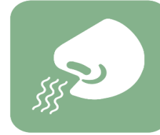
Smells in this area