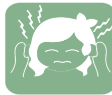
Noise in this area