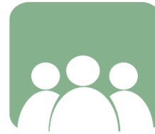
Busy area coming up

If I buy something I will need to wait in the queue to pay. Everyone else waiting in the queue also wants to buy something. It is important we all wait for our turn. This will make everyone happy. I can also bring my own picnic with me.