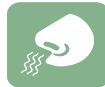
Smells in this area