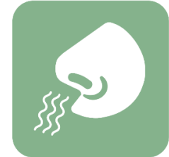
Smells in this area