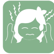
Noise in this area

There might be lots of people so I might have to stand in a queue and wait my turn.